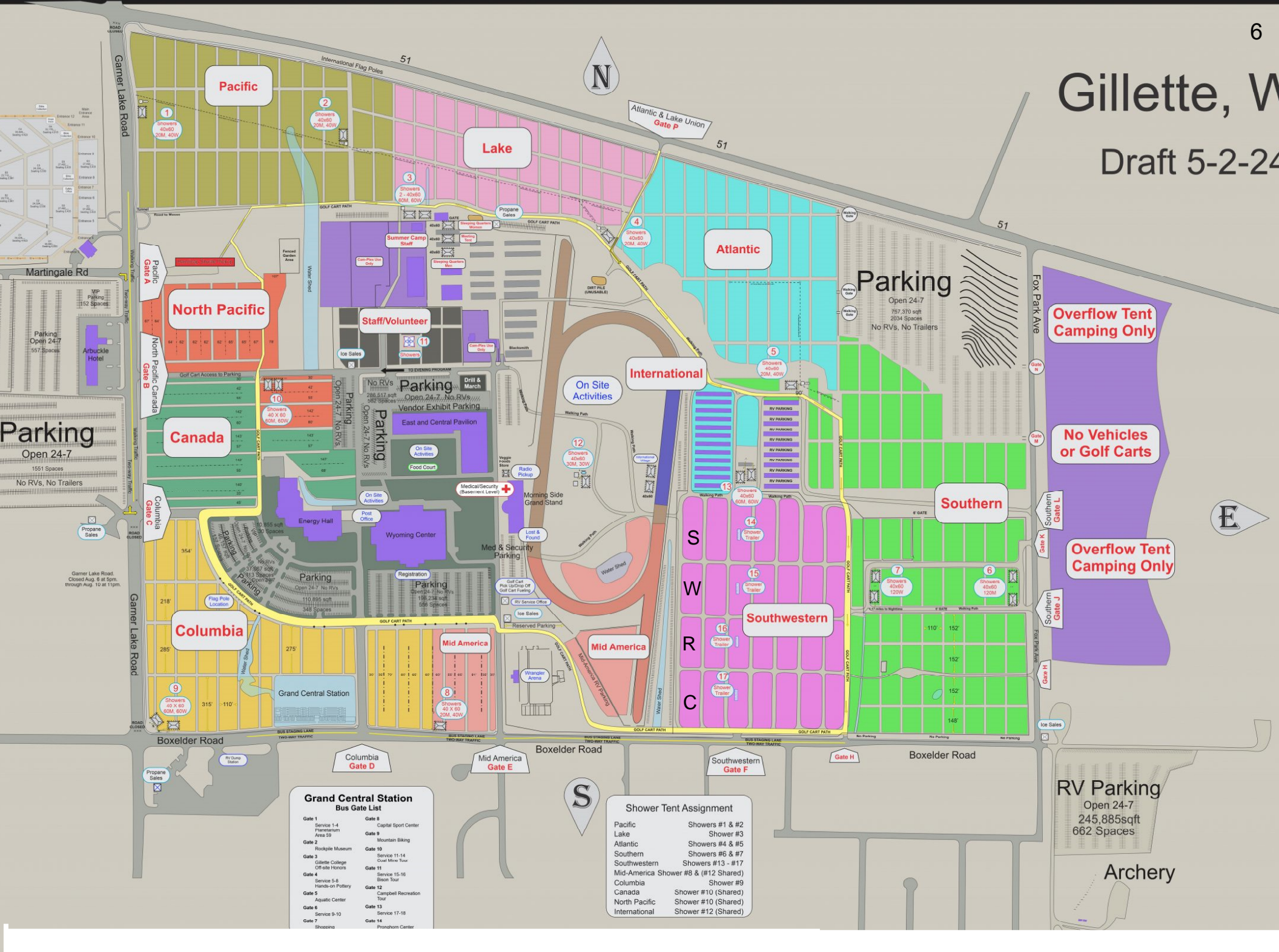
The Land where you see S W R C, is where Southwest Region Conference will be camping.